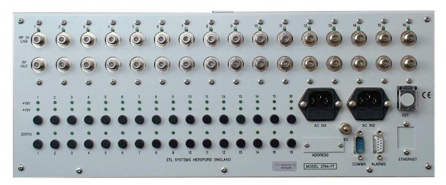
Rear View of Model 2764 with 75 ohm F-type connectors

This unit also benefits from dual redundant hot-swap power supplies, which can be removed via the front panel. Each power supply has a status LED and can also be monitored via a dry contact alarm port on the rear panel.